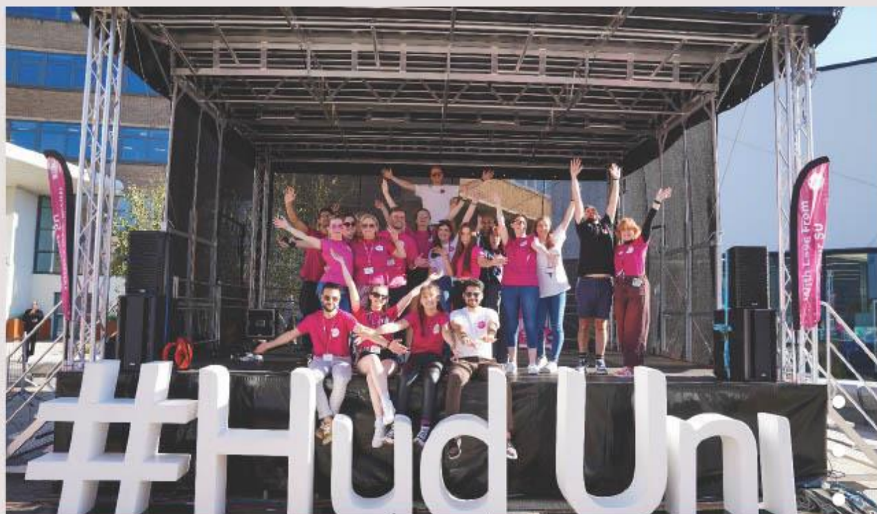
HSU Staff Team: 2024 Welcome Festival