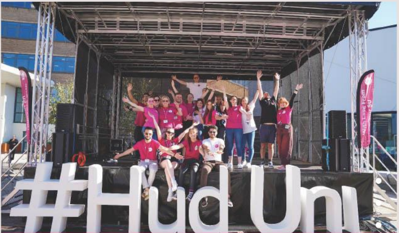
HSU Staff Team: 2024 Welcome Festival